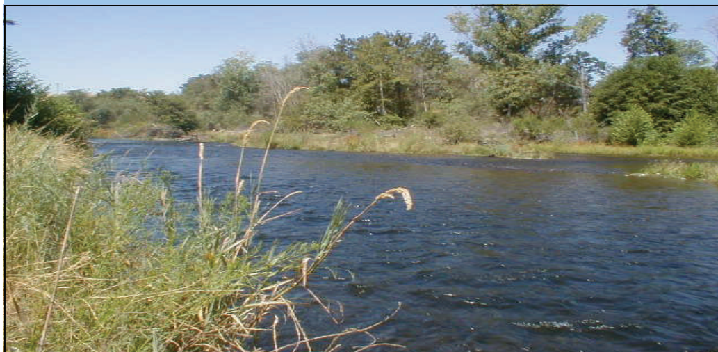
Water in the San Joaquin—May be a more common sight in the future