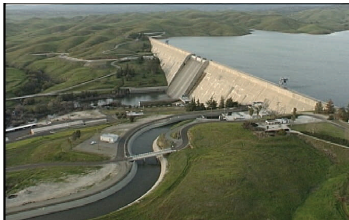
Friant Dam and Friant-Kern Canal

The loss of imported water and expected lowering of groundwater levels within and around TID are obviously significant detrimental impacts to our area. While these impacts are at least eight years off, we are beginning to assess our future course of action to alleviate them. We assume that it's probably not going to be possible, either financially or from a water availability standpoint, to simply buy enough water from willing sellers each and every year to offset the expected losses. Knowing our farmers will likely depend more on groundwater, we plan to emphasize those programs and projects that will increase TID's ability to recharge the underground supply in the wettest of years with what used to be considered surplus supplies. There also may be certain dry years where the